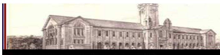
Indian Institute of Science (IISc), Bangalore

“If the Sudra intentionally listens for committing to memory the Veda, then his ears should be filled with (molten) lead; if he utters the Veda, then his tongue should be cut off.” – Manusmriti